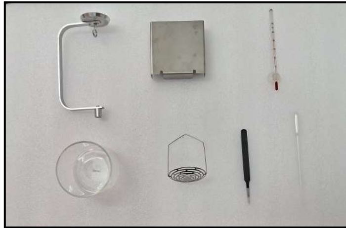
Density Kit for Solid Test Suitable for WENSAR make Weighing Balance